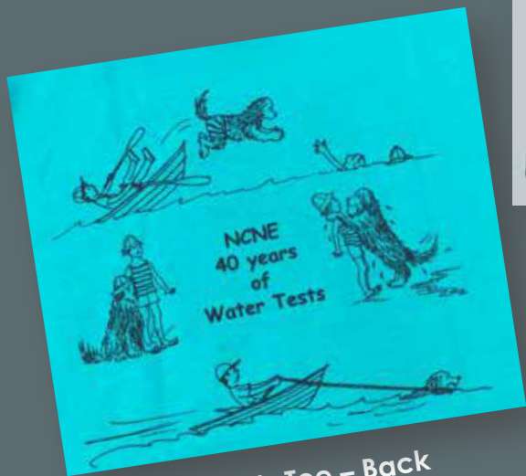
Women's Tee - Back

Women's Tee - color LAT 'Jade' Men's Tee - color Comfort Colors 'Blue Spruce' Sizes S - XXL • $20 plus $6 shipping