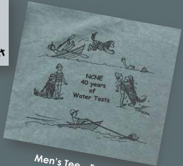
Men's Tee - Back